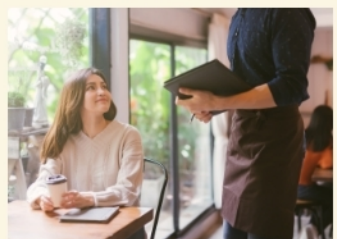
TD Point, TD Central & TD Sports Centre

The epitome of convenience. Jaringan Perhubungan Yang terbaik