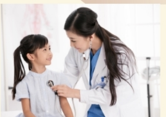
Sultan Ismail Hospital KPJ Bandar Dato' Onn Specialist Hospital