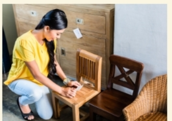
IKEA Tebrau TOPPEN Shopping Centre