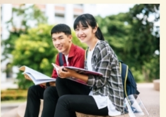
Austin Heights Private & International Schools Fairview International School