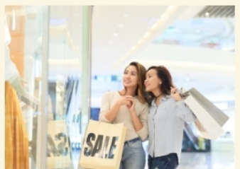
AEON Mall Tebrau City Lotus's Desa Tebrau