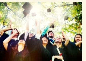
Sunway College Johor Bahru Crescendo International College