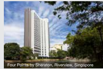
Four Points by Sheraton, Riverview, Singapore