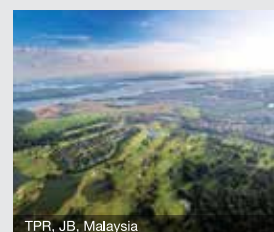
TPR, JB, Malaysia