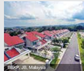
BBKP, JB, Malaysia