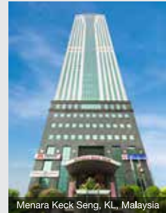
Menara Keck Seng, KL, Malaysia