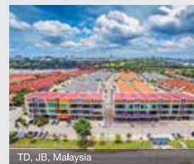
TD, JB, Malaysia