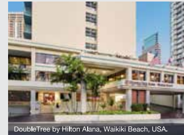
DoubleTree by Hilton Atana, Waikiki Beach, USA.