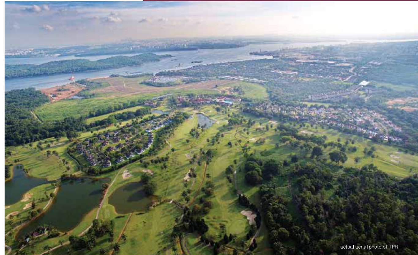
actual aerial photo of TPR

Tanjong Puteri Resort (TPR) is a mixed suburban resort-themed township development by Keck Seng Group constituting approximately 2,100 acres, and is located 2km from our idyllic Tanjong Puteri Golf Resort flanking the Johor Straits. Master-planned as a premium, leisurely yet affordable address; Tanjong Puteri Resort boosts easy accessibility to Johor Bahru City Centre via the JB East Coast Highway and to Pengerang via the newly-upgraded Senai-Desaru Expressway. Prime amenities in our area include The Regency Specialist Hospital, Politeknik Ibrahim Sultan, Johor Circuit, Pasir Gudang Specialist Hospital and a soon-to-open Tesco Supermarket 6km away.