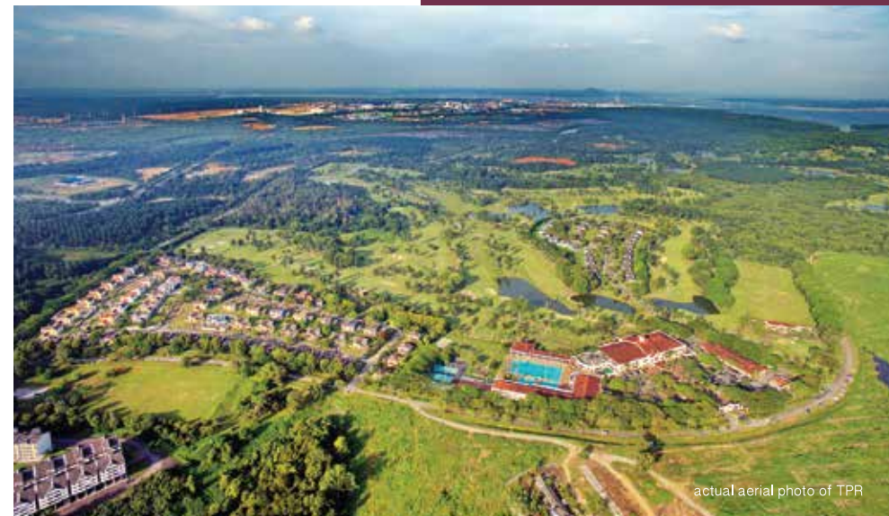
actual aerial photo of TPR