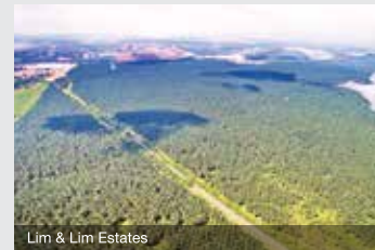
Lim & Lim Estates