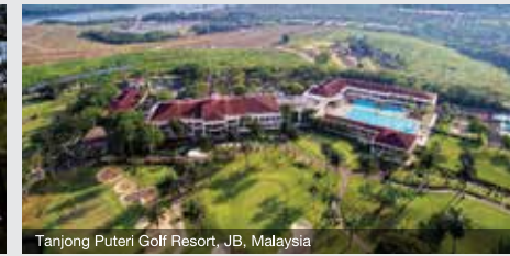
Tanjong Puteri Golf Resort, JB, Malaysia