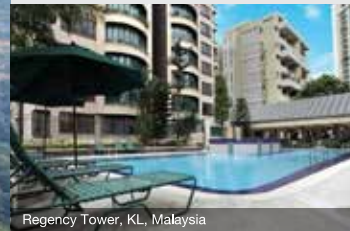
Regency Tower, KL, Malaysia